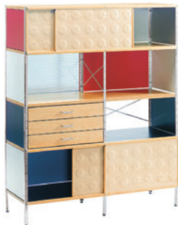
EAMES STORAGE UNIT / ESU BOOKCASE Charles & Ray Eames, 1949 1480 × 1200 × 405 mm