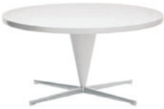
CONE TABLE Verner Panton, 1958 403 × ø 807 mm