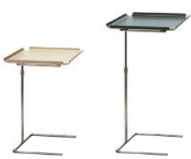
TRAY TABLE George Nelson, 1949 495/695 × 387 × 387 mm