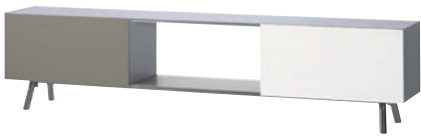
KAST Maarten Van Severen, 2005 580 × 2440 × 400 mm