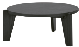
GUÉRIDON BAS Jean Prouvé, 1944 346 × ø 798 mm