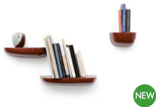
CORNICHES Ronan & Erwan Bouroullec, 2012 352 × 148 × 88 mm, 455 × 219 × 86 mm, 210 × 144 × 116 mm