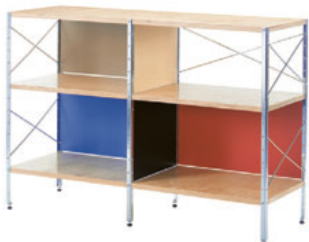
EAMES STORAGE UNIT / ESU SHELF Charles & Ray Eames, 1949 820 × 1200 × 405 mm