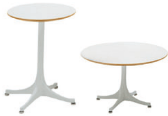
NELSON TABLES George Nelson, 1960 570 × ø 430 mm, 420 × ø 720 mm