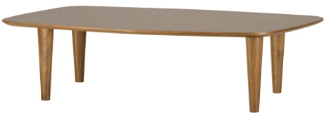
ALBULA TABLE Antonio Citterio, 2010 380 × 1500 × 830 mm