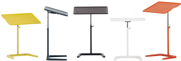
NESTABLE Jasper Morrison, 2007 547 – 770 × 500 × 350 mm