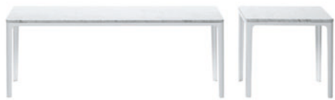
PLATE TABLE Jasper Morrison, 2004 370 × 400/700/1200 × 400/700 mm