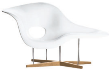
LA CHAISE Charles & Ray Eames, 1948 870 × 1500 × 900 mm