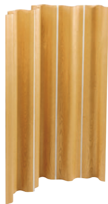
FOLDING SCREEN Charles & Ray Eames, 1946 1720 × ~ 1350 – 1850 mm