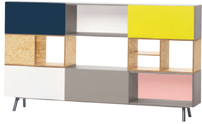
KAST Maarten Van Severen, 2005 1380 × 2440 × 400 mm